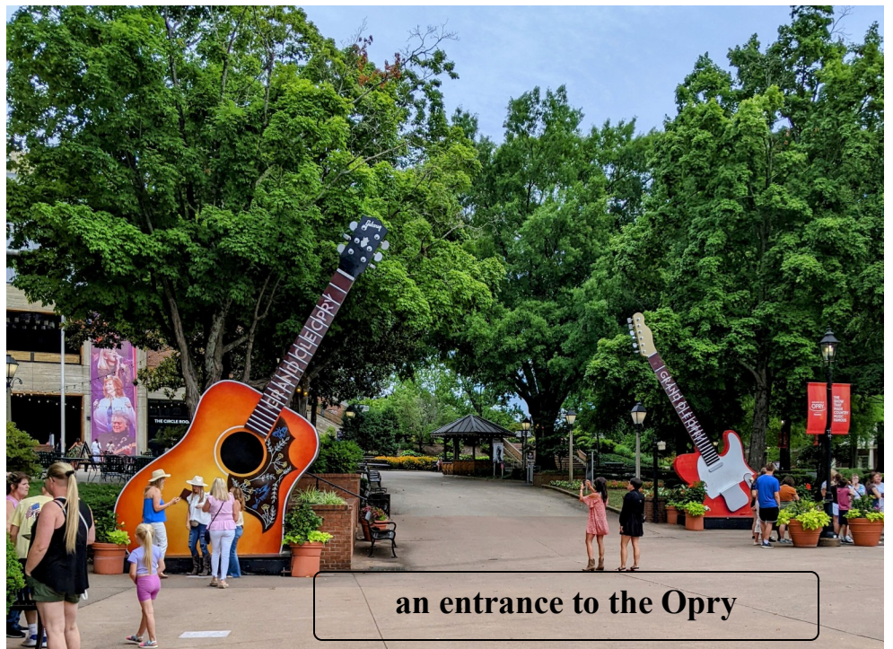
an entrance to the Opry

One of the tours offered was a backstage tour and show at the Grand Ole Opry.