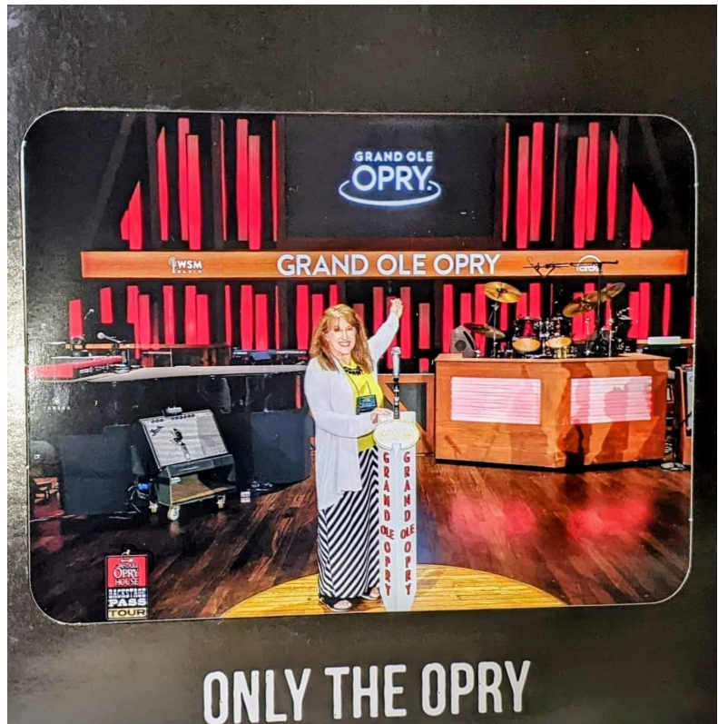
ONLY THE OPRY

Above: Our tour guide told us that $90,000 worth of guitars are hanging from this ceiling!