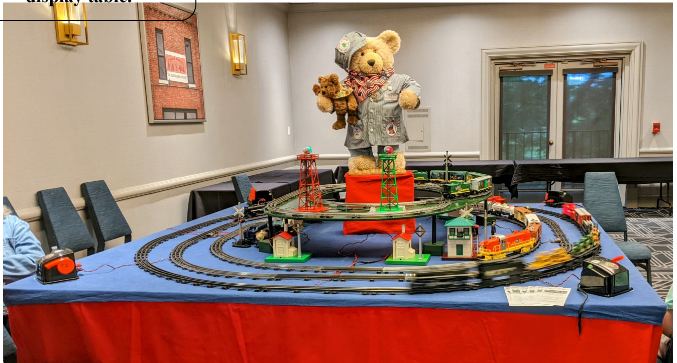
Above: The display was very quiet running and utilized tubular track running on sound-absorbing boards, sitting on 8' tables.