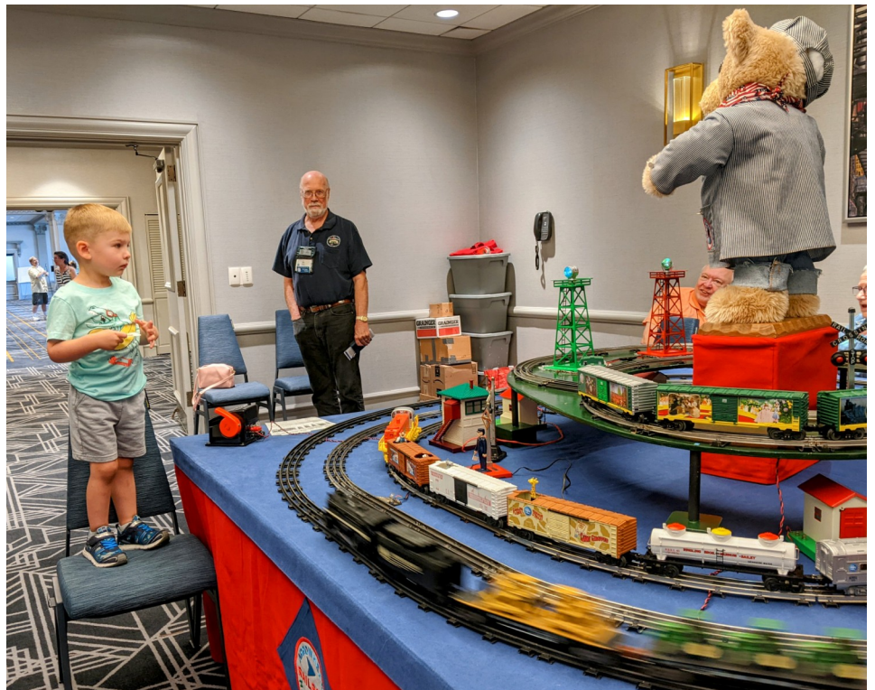
Above: The little guy was thoroughly enthralled with the entire display!